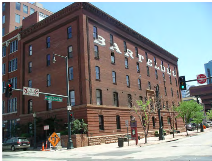
Figure 2: Barteldes Building

View of Barteldes Seed Warehouse on 16th (Sixteenth) and Wynkoop Streets in Denver, Colorado. The International Wine Guild is located on the third floor.