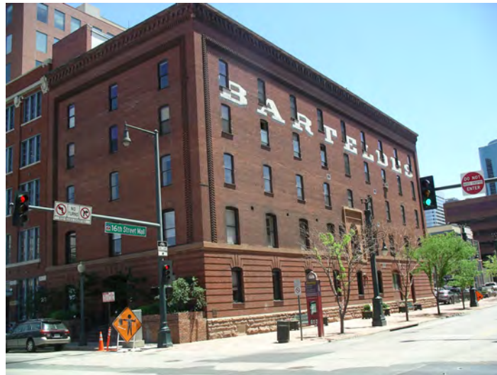
Figure 2: Barteldes Building

View of Barteldes Seed Warehouse on 16th (Sixteenth) and Wynkoop Streets in Denver, Colorado. The International Wine Guild is located on the third floor.